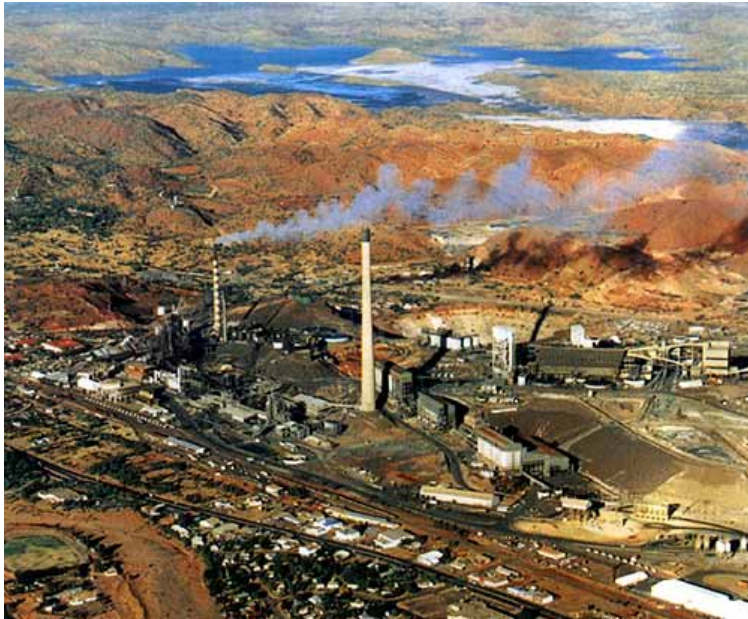
Industrial copper strip-mining = not green!

industrial mining of copper- a very rare metal- is an astonishingly destructive and difficult process. The barren wastelands that result from this process are not green, and solar panels require the existence of such wastelands. Readers are free to draw their own conclusions from these premises.